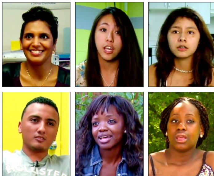
Faces from client stories at The Alternative House web site

Recently, some parishioners from St. Dunstan's joined others from the surrounding community for a "Friends on the Bus Tour", where we visited five of the local Alternative House facilities for youth: the Emergency Shelter for Teenagers; the Culmore Family Resource Center/ Safe Youth Project; the Culmore Teen Center; the Assisting Young Mothers townhouse; and